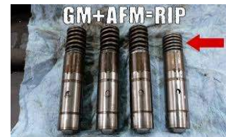
(WITH AFM) NO GOOD