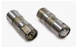
(NO AFM) GOOD